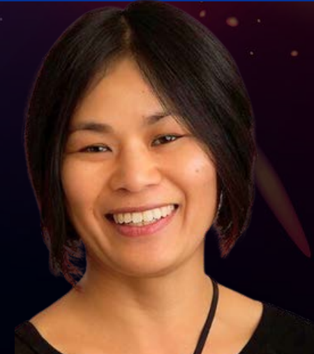
PING LOOK Microsoft