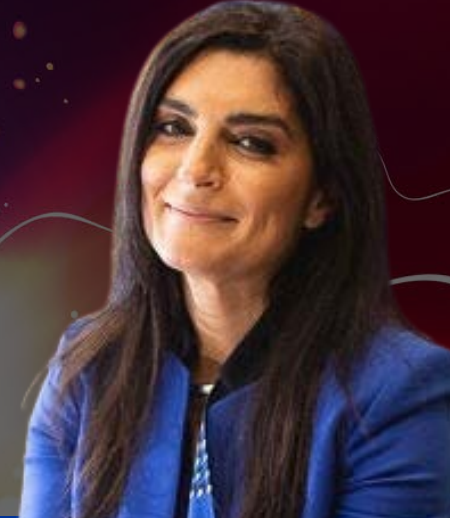
DESPOINA SPANOU EU Cabinet